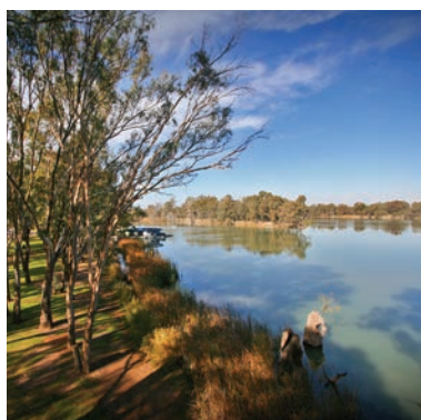
Junction of the Murray and Darling Rivers, Wentworth

Accommodation: Indulge Apartments Mildura