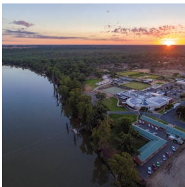
Euston Club Resort on the banks of the Murray River

Accommodation: Euston Club Resort Cabin Park