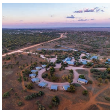
The Mungo Lodge on the edge of Mungo National Park