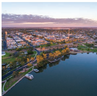
The Murray River at Mildura