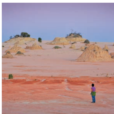
Walk the Walls of China on a Mungo National Park Tour